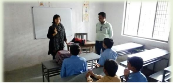
Conducting FGD with students in Indore

It aims to educate and empower school children, youth and communities on Water, Sanitation and Hygiene (WASH) issues. Geographically, the project spreads out to seven cities across the country, namely, Bhubaneswar, Guwahati, Indore, Jammu, Ranchi, Shimla and Srinagar.