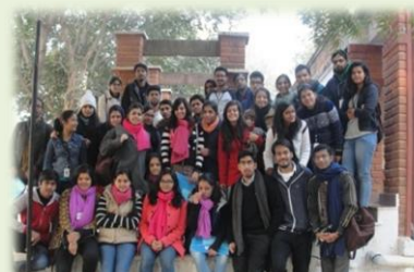
Batch of LEADearth fellows - 2016