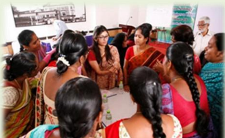
TOT on WASH with Women in Chennai

The project will help to provide valuable experience on energy savings need to the student community, which will help create a motivating force to bring about a positive change in the society.