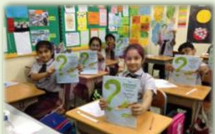
Students participating in GO

This ongoing project aims at harnessing the power of ICT (Information, Communication and Technology) in reaching out to students and teachers on issues related to Climate Change and to touch lives of those schools which have minimal access to technology.