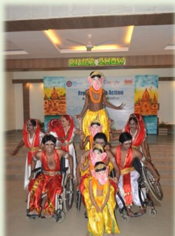
Special Students Performing in River Show

River Ganga, namely Rishikesh, Kanpur, Allahabad, Varanasi, Patna and Kolkata.