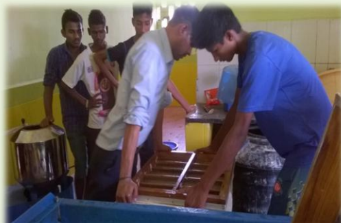
Paper being recycled in the recycling plant.

together with a strong cultural thread. Some of the major activities being conducted over the three year period are: baseline assessments to gauge the environmental and social performance of the member schools, providing identified hardware interventions in place to improve their resource efficiency, conducting various sensitization sessions & site visits addressing environmental and socio-cultural issues and the development of resource material on key sustainable development challenges of the region.