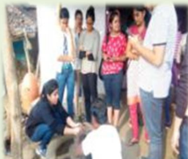
Students trying their hands at pottery

To consider recent advances in ICT technology and its potential in ESD, TERI in partnership with Dell Youth Learning Program initiated Project Climate EduXchange in 2009.