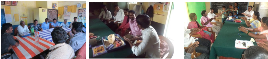
Meeting with stakeholders and SDMC members about Implementing SWACHA shale programme