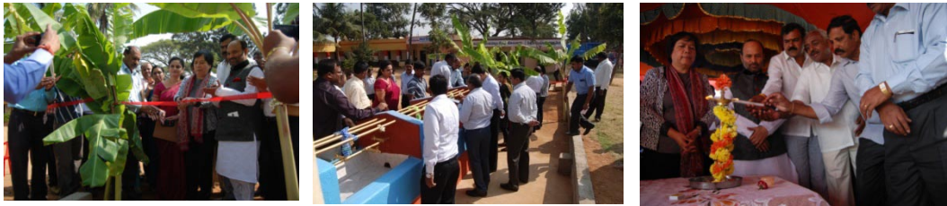
Hand Wash unit Inauguration event under Swacha Shale programme