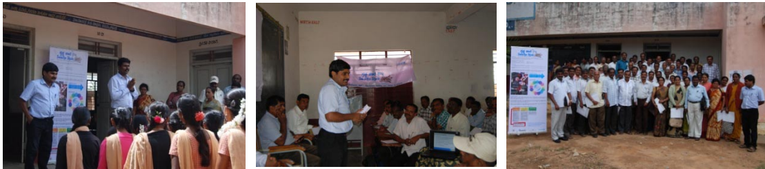
Capacity Building of teachers through orientation