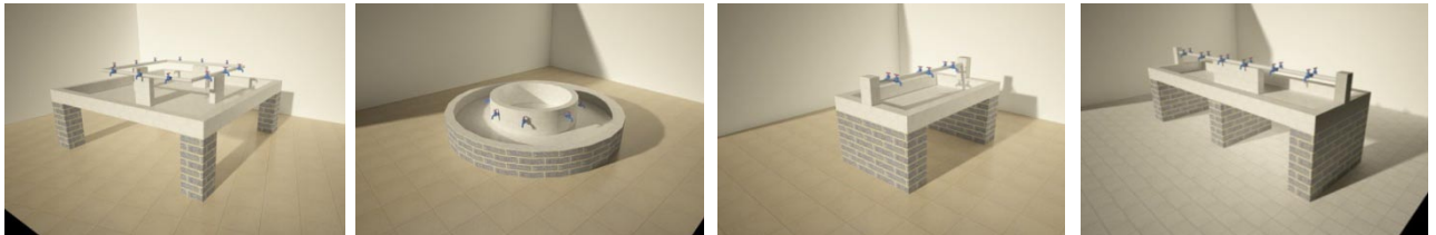
Low cost Hand washing unit model design developed by RCE Bengaluru