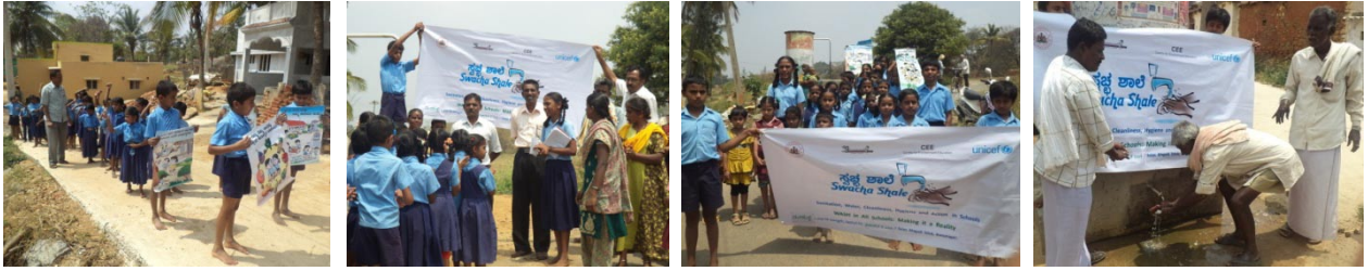
School Students of Solur Hobali involved in transmitting knowledge of Hand wash and its benefits to the community through procession (Jatha)