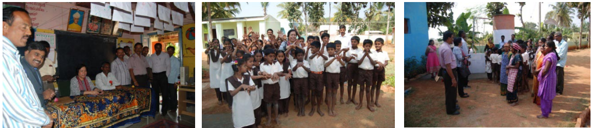
A visit to schools of Solur Hobali by the UNICEF and Education Department