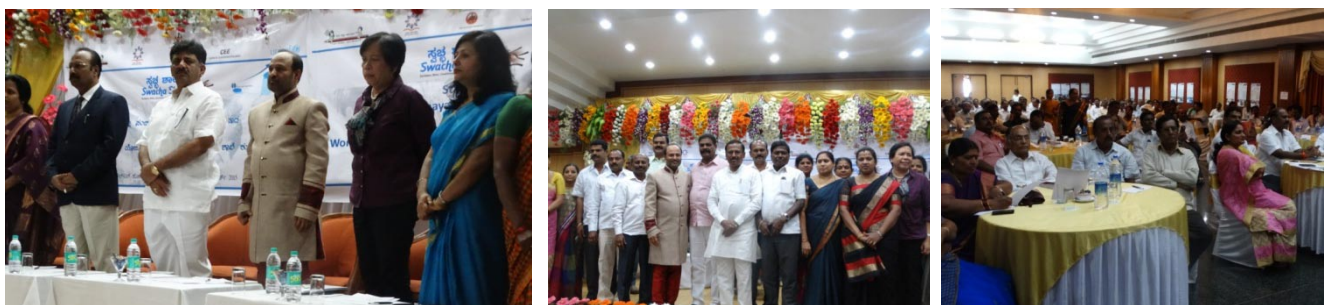
Two day orientation to MDM official and One day Zilla Panchayth Official conclave