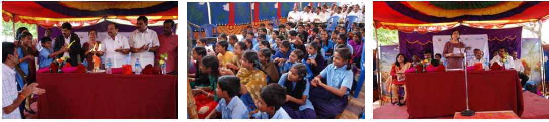
Launch of the Swacha Shale programme in Solur Hobali