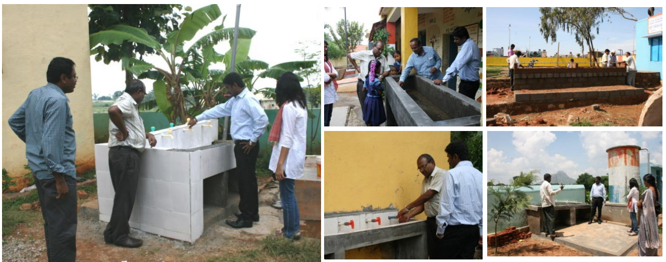
Constructions of Hand wash unit and its follow-up and inspection by the RCE