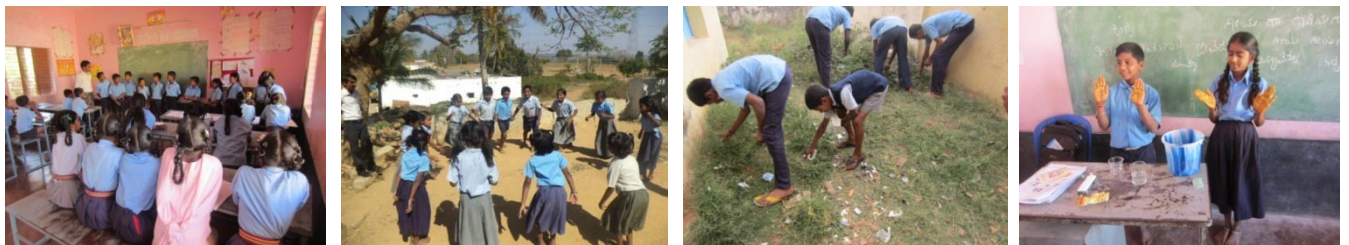
Children hygiene education camp